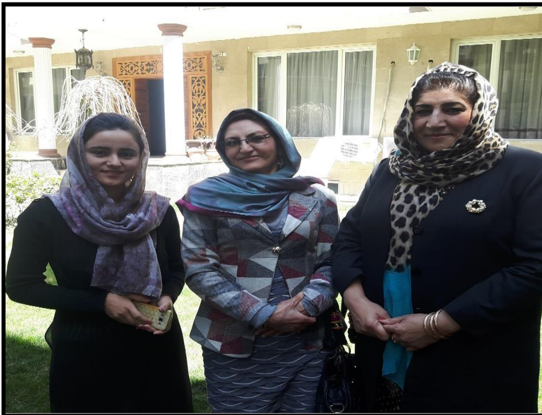
Lady participants to the workshop