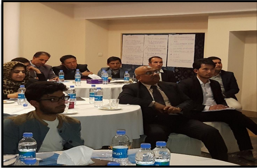
Session in progress